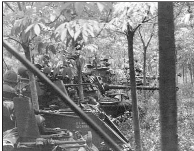
K Troop "In the Rubber" prepares for a "Mad Minute" before attacking an enemy bunker complex, 1969.