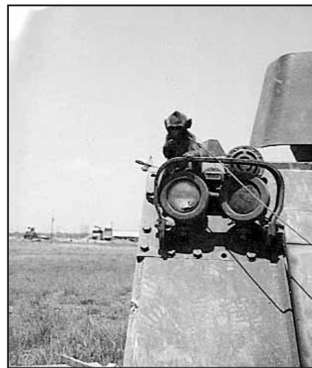
Art the monkey takes charge of the track. Art was the mascot of A Troop, 1969.