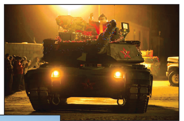
"Santa's Tank", Christmas at Fort Irwin.

Editor's Note: This article was inadvertently omitted from 1st qtr 2024 Thunder Run. I apologize for any inconvenience.