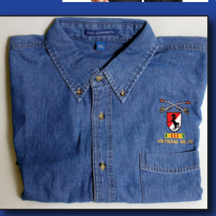
#41 & 42 Dark Denim Shirt Available in Long and Short Sleeve