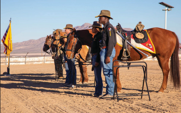
The 11th ACR Horse Detachment retires "Fritz", "Comanche" and "Garryowen".