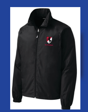
#51 Lightweight Wind Jacket $34.00