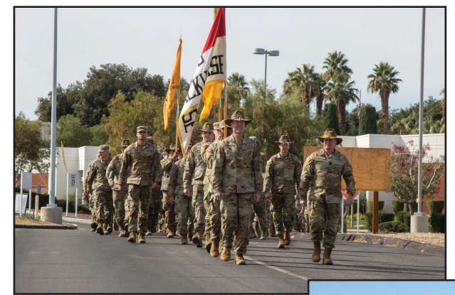
"The Long Walk", 38 miles from Fort Irwin to the Barstow Veterans Home, an annual tradition.

Our final force-on-force fight was in November against 3rd ABCT, 4th Infantry Division and the Regiment did exceptionally well. We followed that with a break for Thanksgiving and a Blackhorse Commander's Cup challenge, which 2/11 "Eaglehorse" took in a close competition. As we moved into the final weeks before the holiday, we conducted multiple training exercises to include a tank gunnery, team and squad