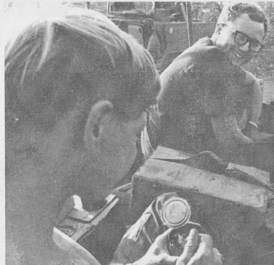
T-BONE ANYONE—People who've never spent any time on an ACAV just don't know what they're missing. Where else could you have Italian sausage, tuna, sardines and warm soda for breakfast?

At the conclusion of this last phase, the trainee must take the Gastric Endurance Proficiency Test (GEPT), which basically consists of more of the same treatment. Those failing the exam are either recycled or mercifully given a medical profile.