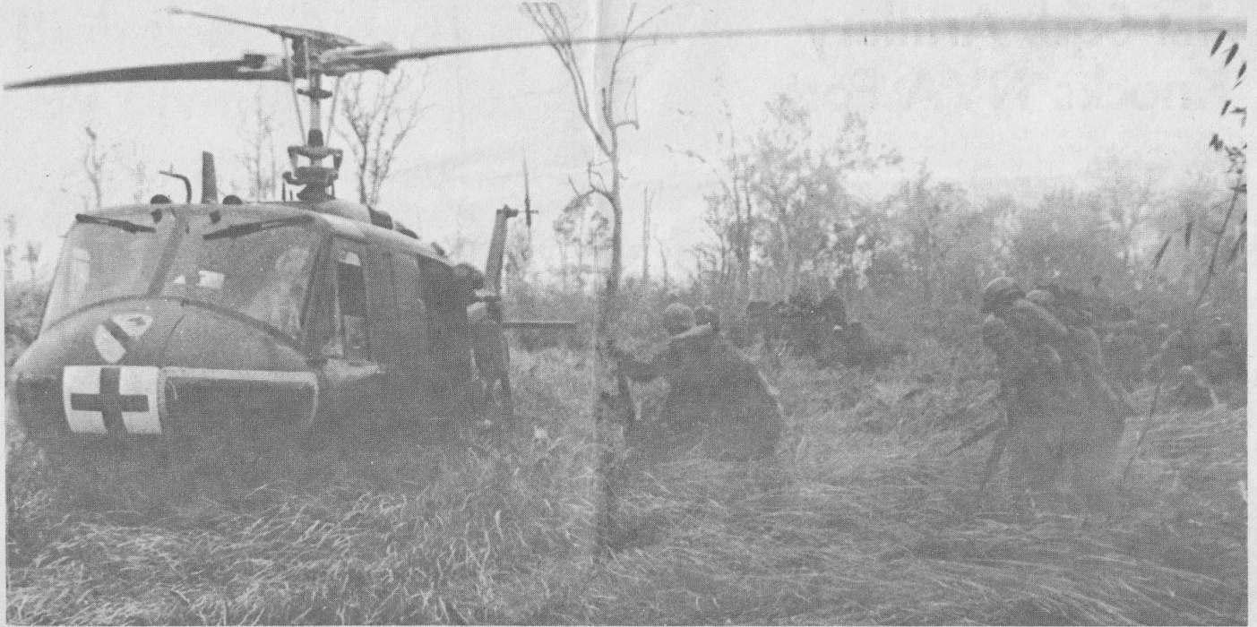
MEDEVAC CHOPPER TOUCHES DOWN TO EVACUATE WOUNDED FOLLOWING HEAVY FIGHTING NEAR TAY NINH