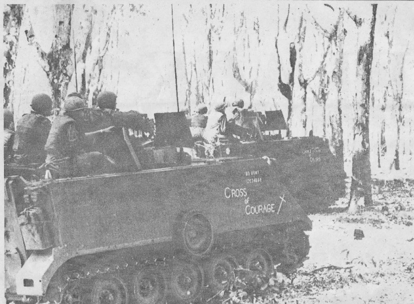
THE SEARCH—Blackhorse ACAVs from A Troop search of enemy bunker complexes. The rubber rumble through the rubber near Tay Ninh in is a favorite hiding place of the NVA forces.

Now might be a good time and place to take a good long look at the "bust" your life is in to see if it ends in true happiness or something less than that. You may even want to find someone else to "track," someone whose trail leads to God Himself because if you look closely, you'll see these are the truly happy people.