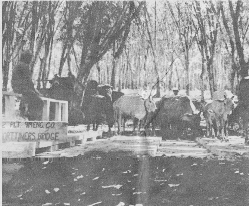
BEFORE THE CEREMONY —A herd of cattle opened the 919th Engineers 'Shortimers' bridge before the official ceremony. The bridge, which

Then, on October 7, a month after arriving, Blackhorse troopers set out on their first combat operation.