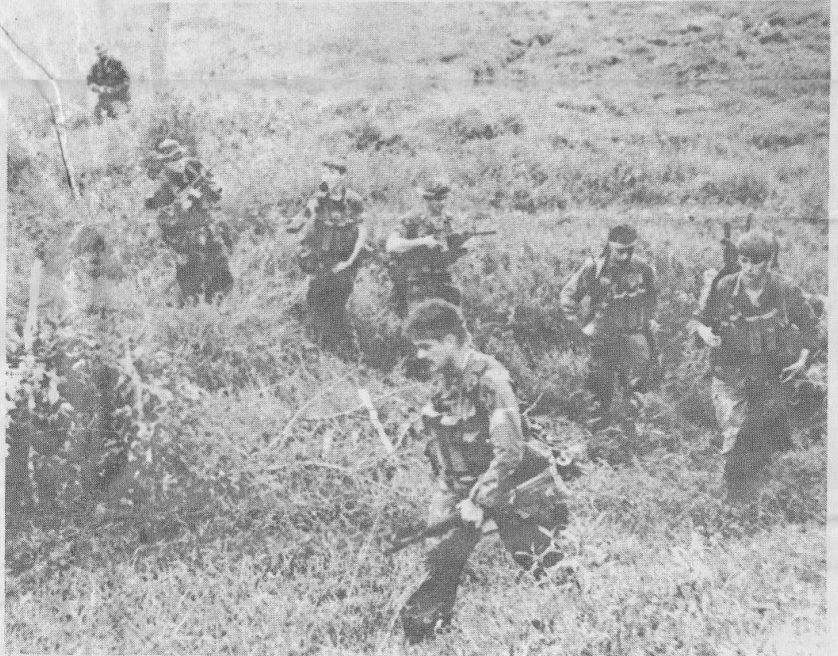
MOVE OUT—Air Cav Troop ARPs move out of an LZ at first light to check an area west of An Loc for possible enemy movement. The operation coincided with a similar effort by ARVN forces.