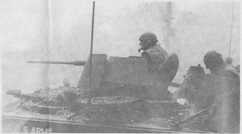
HEAVY CONTACT —An I Troop ACAV engages Cobra gunships, artillery and tactical air strikes aided the ground elements during the encounter.

The mission was apparently successful: Electronic surveillance by squadron intelligence later revealed no trace of enemy activity.