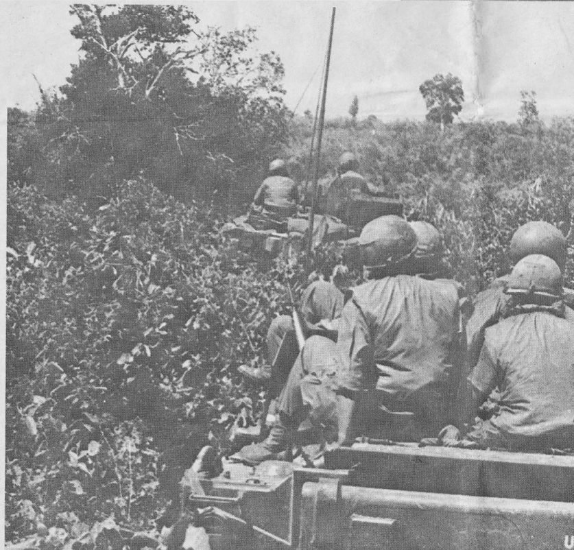
PUSHING FORWARD — A Troop ACAVs push their way through scrub jungle near Tay Ninh. It's the constant pushing forward that makes life on a Blackhorse ACAV a rugged one.